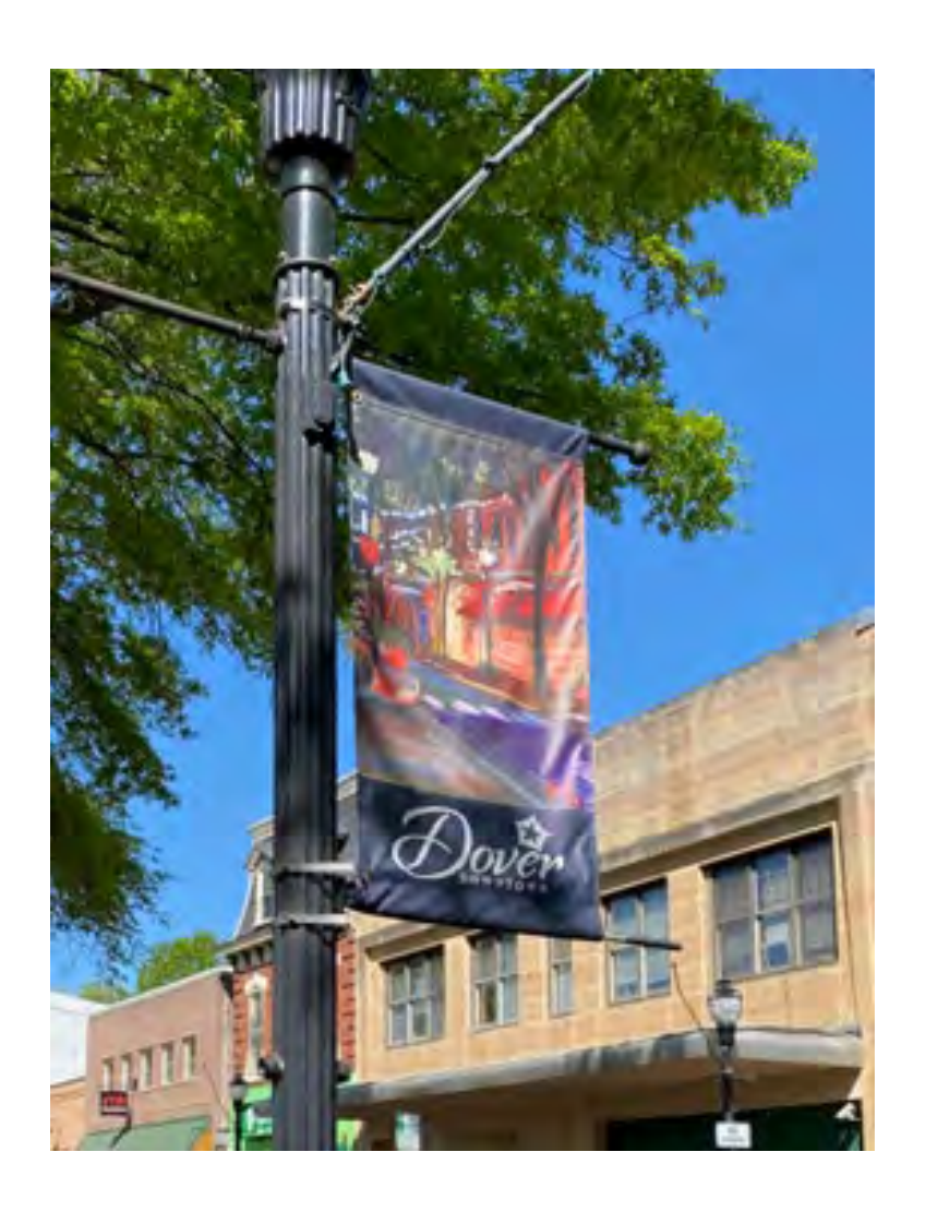
Paint Dover images can be seen throughout the year in downtown Dover.